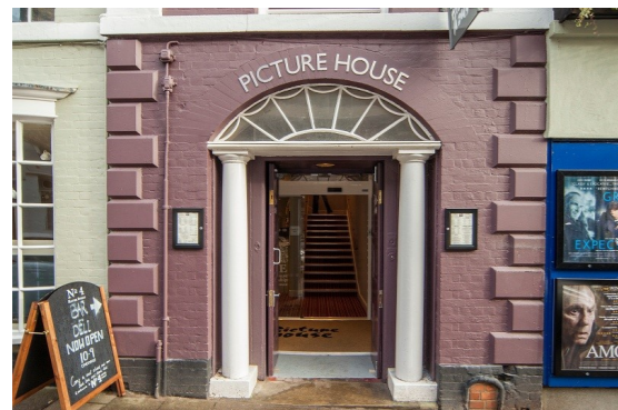
Left: The Abbeygate Picturehouse Bury St Edmunds