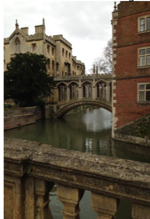
St Johns College, the Bridge of Sights, Cambridge.