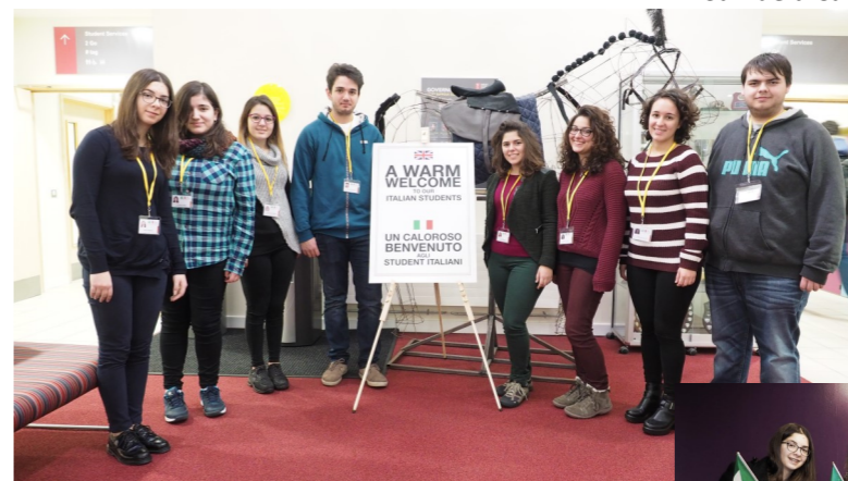
The students on their first day at West Suffolk College in Bury St Edmunds.