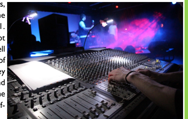
The performing arts stage as seen from the mixing desk

them. This was one of the nicest lessons I've never been at. Caterina Tumino