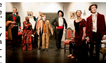
Left: The Conservatoire East cast of 'A Flea in Her Ear'

On Saturday we had the pleasure to be present at the comedy "A Flea in Her Ear" played by some WSC's students. The story is essentially based on the suspect of a possible love affair which separated the two main spouses, Raymonde and Victor Emmanuel Chandeise, and on particular events which got involved the other characters. The actors created a lovely atmosphere thanks to squabbles, misunderstandings and a great scenery which included 20th century typical props, curtains, stairs and also a revolving bed. Characters like the unlucky Camille, the funny Dr. Finache and the Spanish Histangua