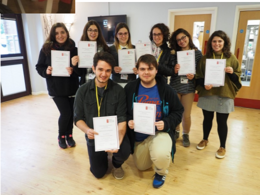
The students leaving for the airport.

credible experience. For lunch we were invited to join at Edmund, a restaurant managed by university students and there the International staff gave us our certificates and we took the final photo all together. It was hard say goodbye to all