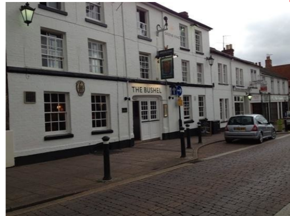
The Bushel pub, Bury St Edmunds